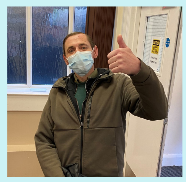
For more information, visit www.healthbus.co.uk